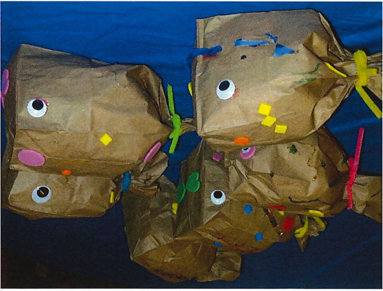
The Pout Pout Fish